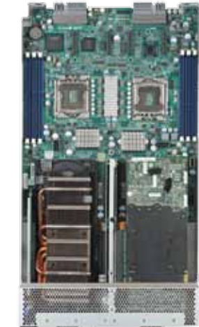
NEW! GPU Blade 2 GPUs + 2 CPUs in 1 Blade

Supermicro also offers low-noise blade solutions that are optimized for offices and SMB. The OfficeBlade™ is ideal for SMB as well as personal supercomputing applications. With acoustically optimized thermal and cooling technologies it achieves < 50dB with 10 DP server blades and features 100-240VAC, ultra high-efficiency (94%), N+1 redundant power supplies.