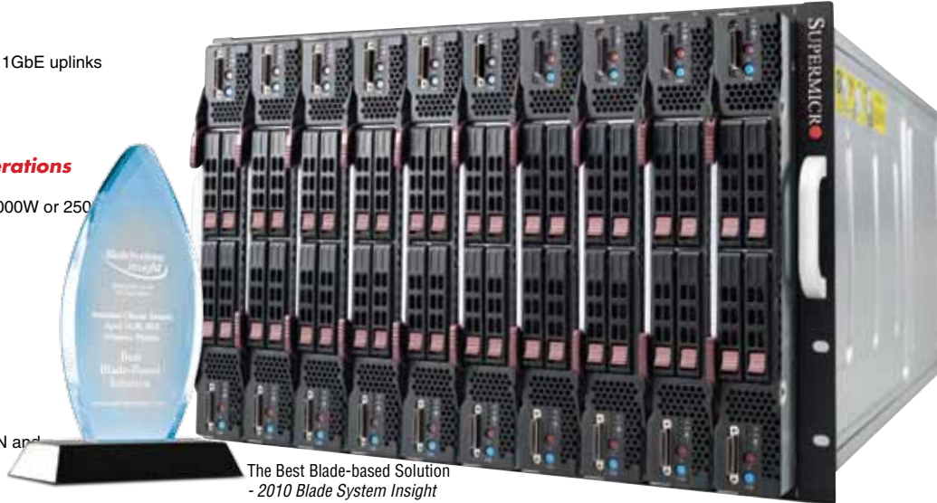
The Best Blade-based Solution - 2010 Blade System Insight