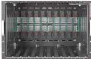
* SBE-710E Shown