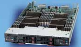
Intel & AMD DP TwinBlade

Enterprises, Financial Services, Databases, Datacenters, Research Labs, High Performance Computing & Offices