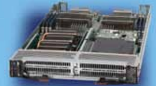
GPU Blade w/ Two Tesla M-series GPUs