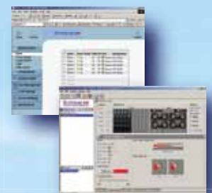
CMM IPMI View