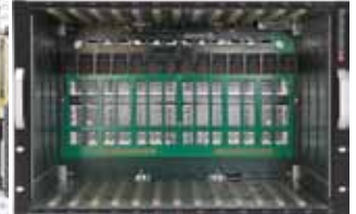
* SBE-714D Shown