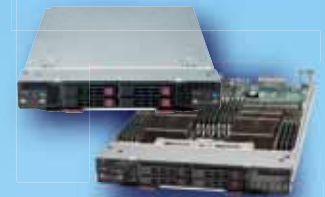
4-way AMD Processor Blade