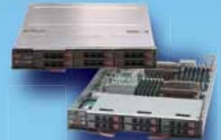
Intel DP Blade w/ Six 6Gbps SAS2 HDDs