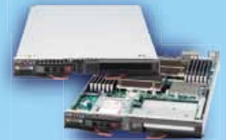
Intel DP Blade w/ PCI-E 2.0 x16 Expansion Slot